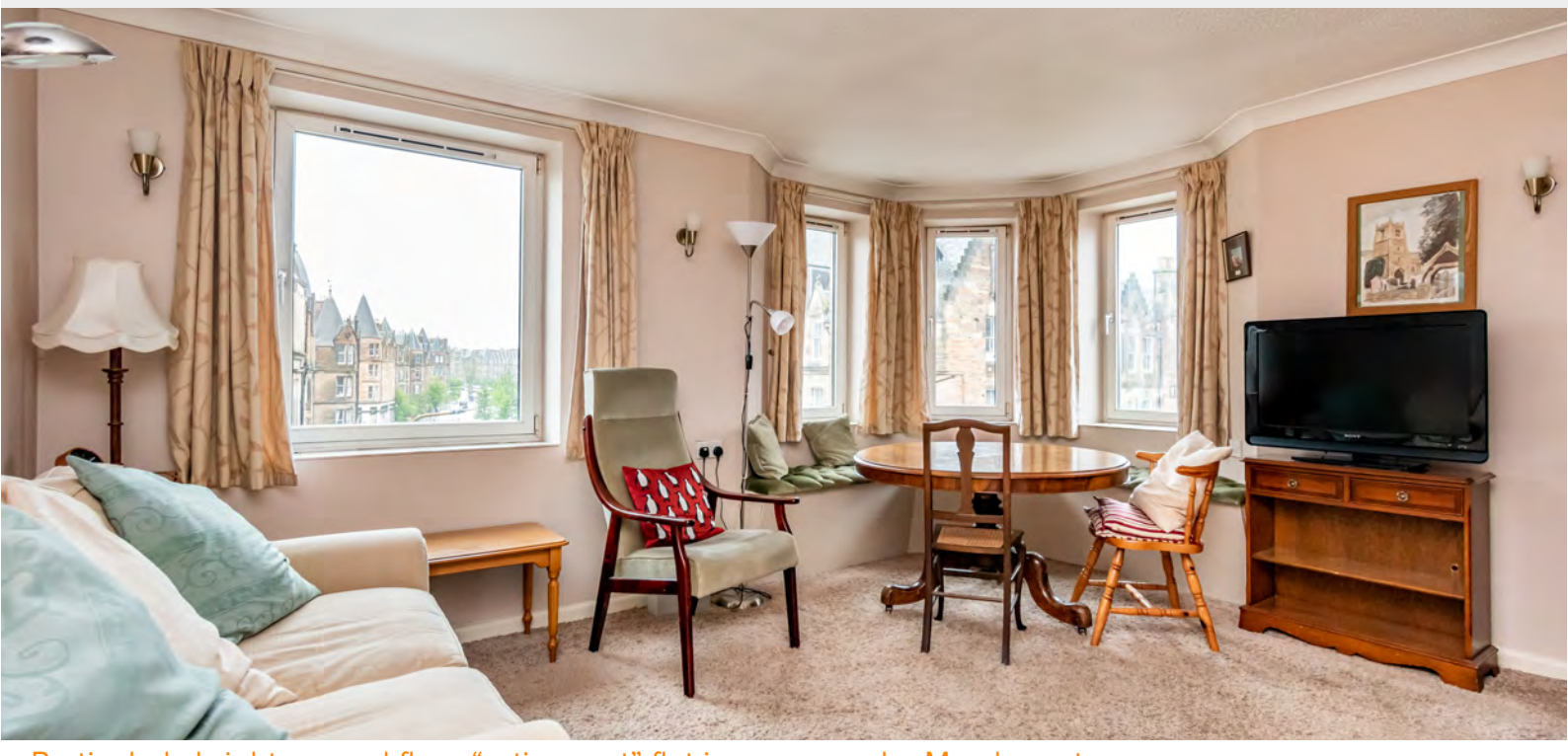
Particularly bright second floor "retirement" flat in ever popular Marchmont

Postcode: EH9 1TP Bedrooms: 2 Council Tax: Band D