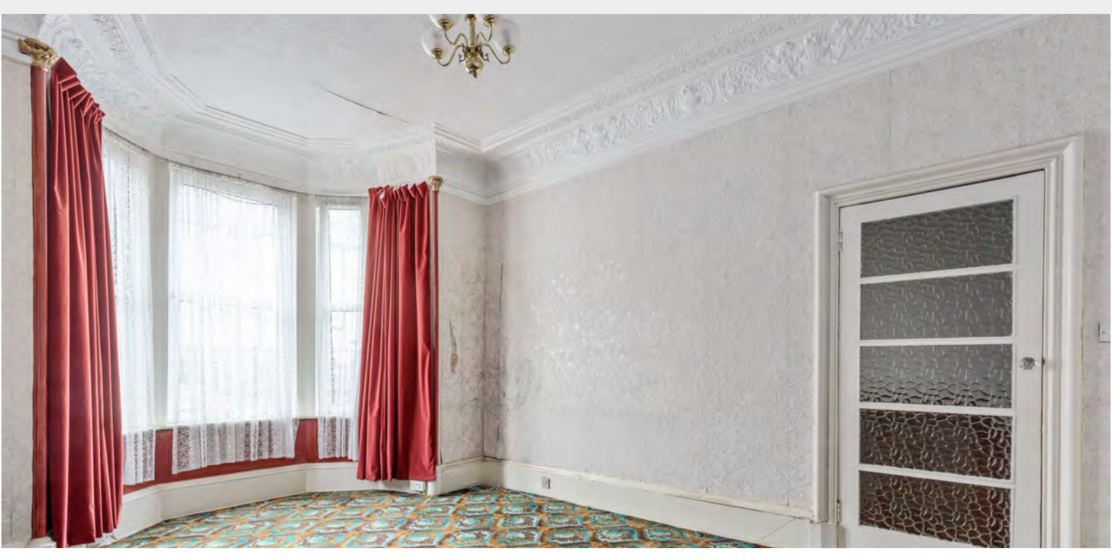
Four-bedroom Victorian semi-detached villa seeks new owner for TLC

Postcode: EH87DF Council Tax: Band F Bedrooms: 4